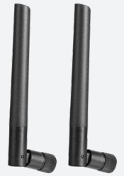
2 x External Antenna