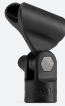
1 x RM5