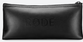
1 x ZP1