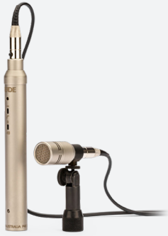
1 x NT6