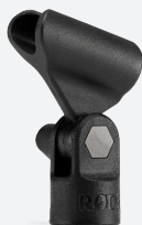
1 x RM5