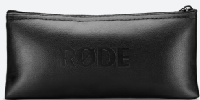
1 x ZP1