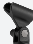
1 x RM5