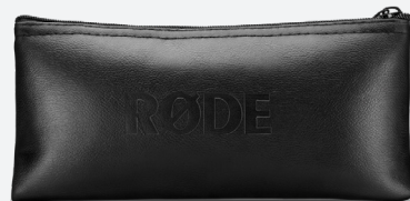
1 x ZP1